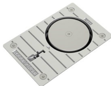
HC114R Stainless Steel Retention Socket